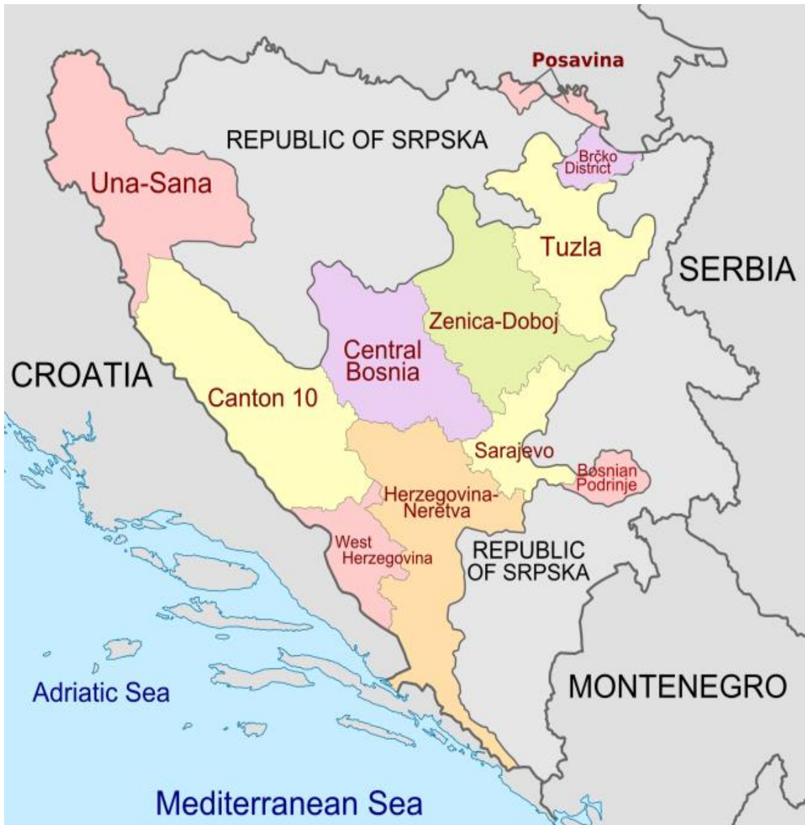
Map 1: Canton Map of FBiH. 1