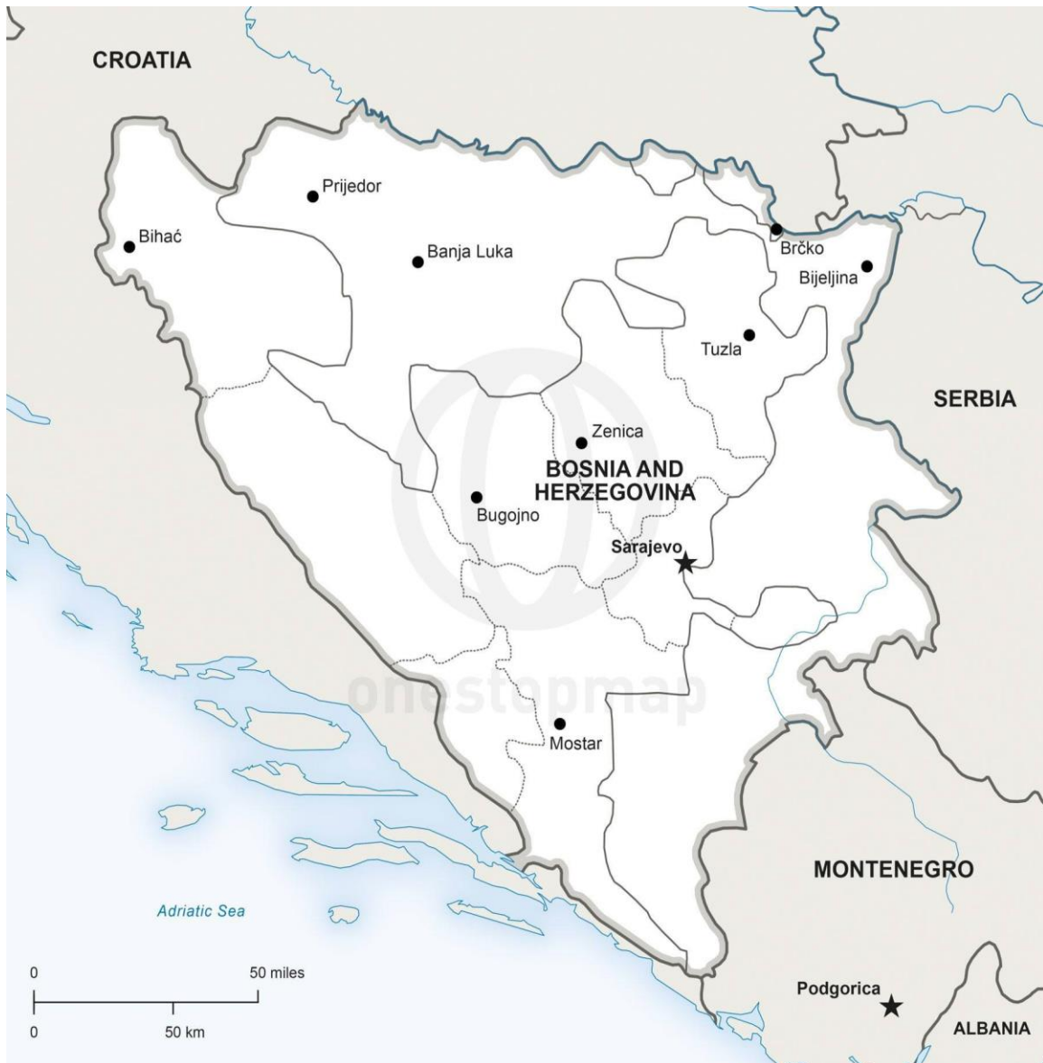
Map 2: City Map of BiH. 2